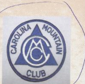
CAROLINA MOUNTAIN CLUB: Founded in 1923, club members supported national park efforts, and were instrumental in completion and maintenance of significant sections of the Appalachian Trail—routing, marking, measuring, and maintenance. CMC was one of the first clubs to adopt the "overseer" system of trail maintenance, assigning each member to a 3-5 mile section of trail.