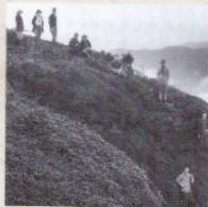
SMOKY MOUNTAINS HIKING CLUB: Founded in 1924, SMHC was a strong community of early national park supporters. Its role has evolved through the decades as members remain dedicated to hiking and have increasingly shouldered responsibilities for trail maintenance and efforts to