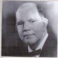
MARK SQUIRES: State senator from Lenoir, NC, he led the campaign for the national park in North Carolina. He was able to secure critical state funding despite strong opposition from logging interests, especially by Champion Fibre Company, and lukewarm interest by the governor in the late 1920s.

Founded in 1923, club members supported national efforts, and were instrumental in completion and maintenance of significant sections of the Appalachian Trail—routing, marking, measuring, and maintenance. CMC was one of the first clubs to adopt the "overseer" system of trail maintenance, assigning each member to a 3-5 mile section of trail.