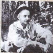
HORACE KEPHART: Librarian, author, and outdoorsman from St. Louis who fell in love with the wilderness and people of the Smokies after arriving in 1904 to recover from a nervous breakdown. His books are classics, stirring interest in outdoor recreation ( Camping and Woodcraft ) and Appalachian culture ( Our Southern Highlanders ). He was a vocal campaigner for establishment of the national park, helped plot the Appalachian Trail through the Smokies, and served on the nomenclature committee. Mt. Kephart was named after him in 1931.