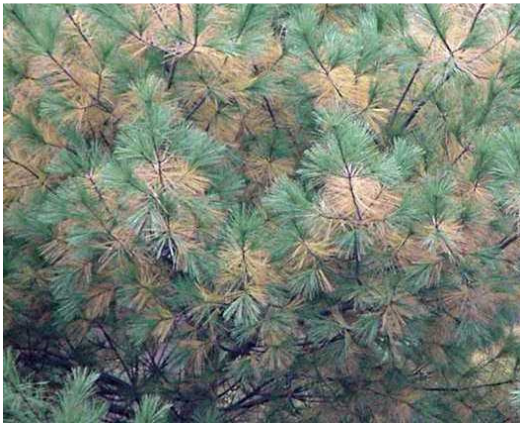
Plants On The Trail