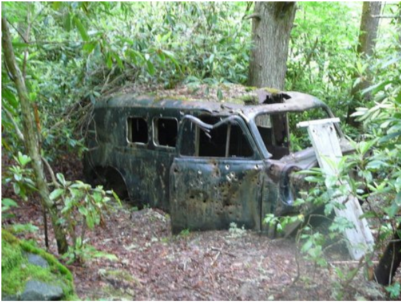
from Joyce Kilmer Camporee