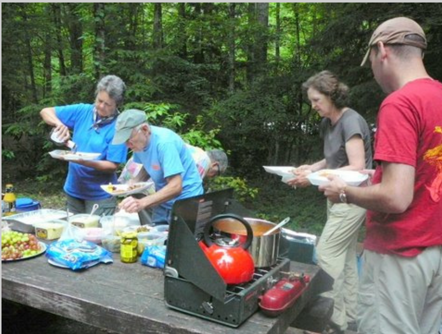
Joyce Kilmer Camporee