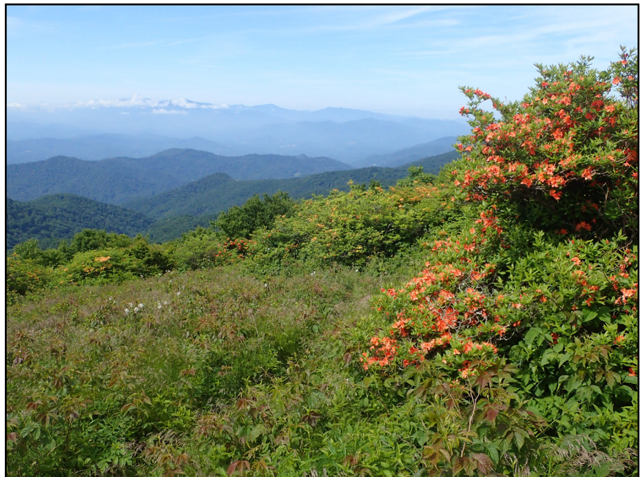
Spring brings flame azaleas to Roan Mountain.