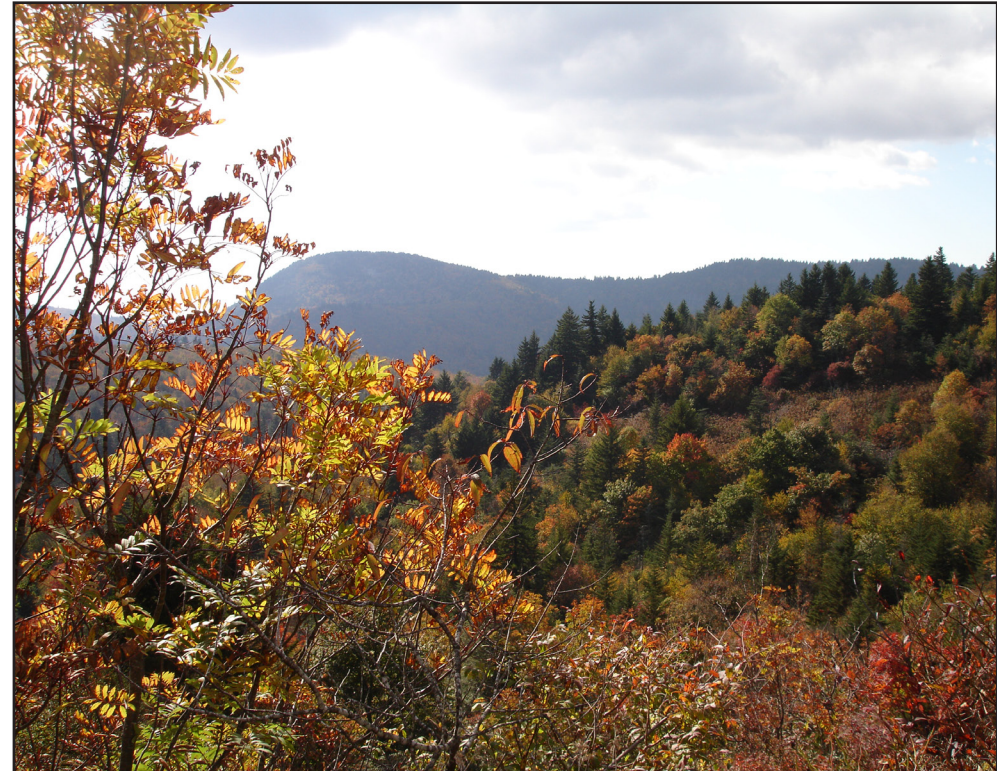
The view from the Mountains to the Sea trail near Devil's Courthouse.

I'm pleased to announce that our speaker will be Kevin Adams, photographer and author of several nature photography and hiking books including the newly published third edition of North Carolina Waterfalls . This latest book includes 1,000 waterfalls along with directions and photographs of 300 of the falls. Copies of his book will be available for sale at the meeting.