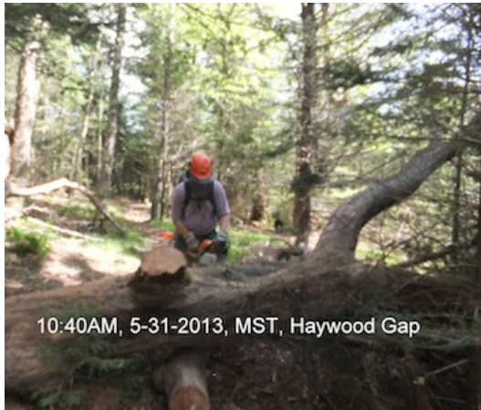
10:40AM, 5-31-2013, MST, Haywood Gap

If you are hiking on clear trails this summer, thank a maintainer.