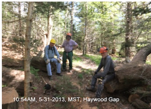
10:54AM, 5-31-2013, MST, Haywood Gap